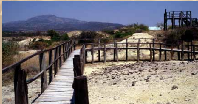
The Cradle of technology.

Here you will find the highest number of stone tools in the world, also known as the "stone tools factory". The site is also host to a large number of migratory birds.